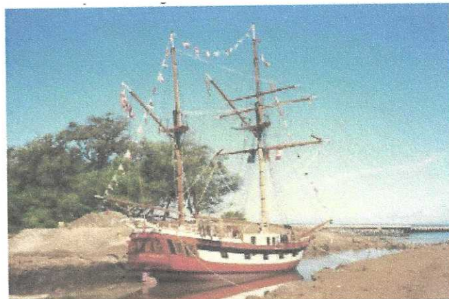
Figure 1. Hawaiian Chieftain .

Her maiden voyage, in 1990, was to French Polynesia. She arrived in Papeete on April 20 of that year. She was based in Sausalito, CA for many years, providing experiential programs teaching elementary school children about West Coast exploration and trade in the late 1700s. Since 2021, Hawaiian Chieftain has undergone a complete overhaul and restoration journey in collaboration with the distinguished boat builders, spar makers, and rigging masters of Port Townsend, Washington. During this time, Hawaiian Chieftain has been supporting and collaborating with the Northwest School of Boat Building providing a work force platform for graduating students. As we are visitors to the North Pacific, we have prioritized collaboration with Salish Nation youth groups and other area tribal entities working to empower indigenous peoples.