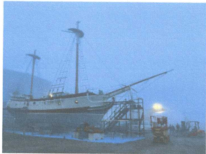
Figure 3. Chieftain (current) in drydock restoration in Port Townsend, WA.

Working diligently with the United States Coast Guard, Hawaiian Chieftain is set to achieve the appropriate Certificate of Inspection to maximize the scope of opportunity to achieve our mission. After the completion of sea trials throughout Puget Sound, we intend to travel down the Pacific West coast before our journey across the Pacific, potentially collaborating with NOAA's National Marine Sanctuaries Program and associated community groups on education and outreach activities. Once Hawaiian Chieftain returns to Hawaii it will be homeported in Kailua Kona, Hawaii Island. Due to the recent and heartbreaking decimation of Lahaina, our immediate intentions are to assist with appropriate, long term community relief efforts.