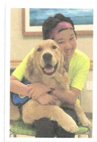
Hospital Facility Dog Samson