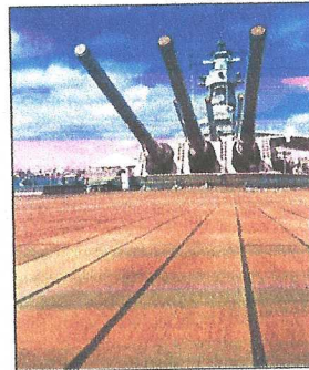
New Teak Deck