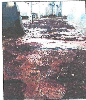
Rusted Steel Deck

With nearly 80% of the main deck completed, the remaining deck restoration includes the historic "Surrender Deck" where the WWII Instrument of Surrender was signed. The photos below depict the rusted condition of the original deck and a section of the new teak deck restoration.