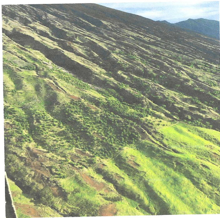
Image of restoration areas where initial plantings have taken place. The impacts of fencing to exclude animals and the combination of passive restoration as well as strategic plantings are evident.