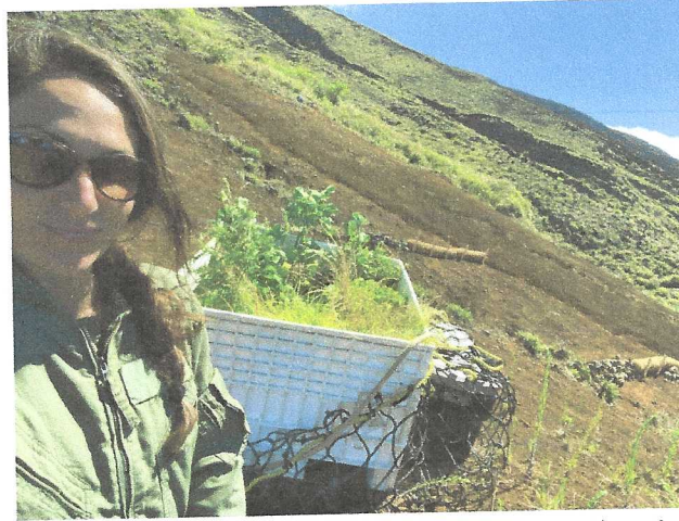
Image showing the severe erosion on the slopes of Haleakala volcano, as well as the transportation method for moving plants grown from regional seed stock into the remote restoration sites via helicopter.

How your organization is meeting that need: