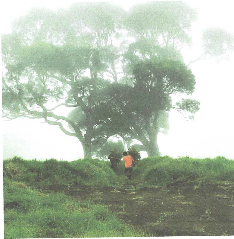
Image of volunteers assisting with planting at Kahikinui, Maui.