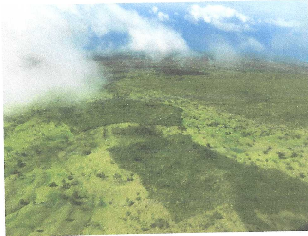
Image showing two restoration sites at Auwahi, Maui where primary restoration has been completed, demonstrating the potential for returning degraded landscapes back into native forest. Auwahi is where the restoration methodologies for dryland koa forest restoration were developed.