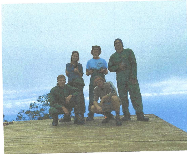
Uhiwai field staff awaiting helicopter pickup after a backcountry planting trip.